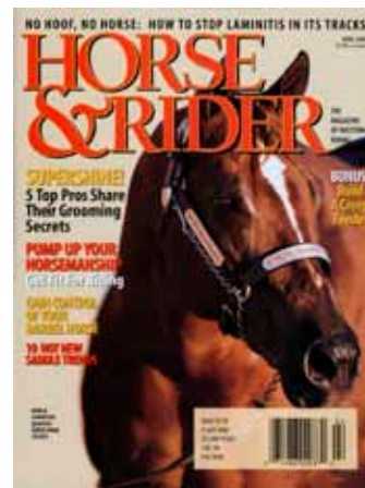
"BONAFIDE COWGIRL" ; "TOP COLLEGE RIDERS COMPETE"

In our April 2000 issue, H&R reported that horse sales were booming. "That's the word from Professional Auction Services, Inc., which holds top auctions all around the country. Last year, the firm posted a 24-percent growth in gross sales—a record." The High Points item also noted that for the first time at a PAS auction, two horses, both Quarter Horse stallions, brought more than $100,000: Zippo A Ward (fetching $165,000), and An Awesome Mister ($227,000).